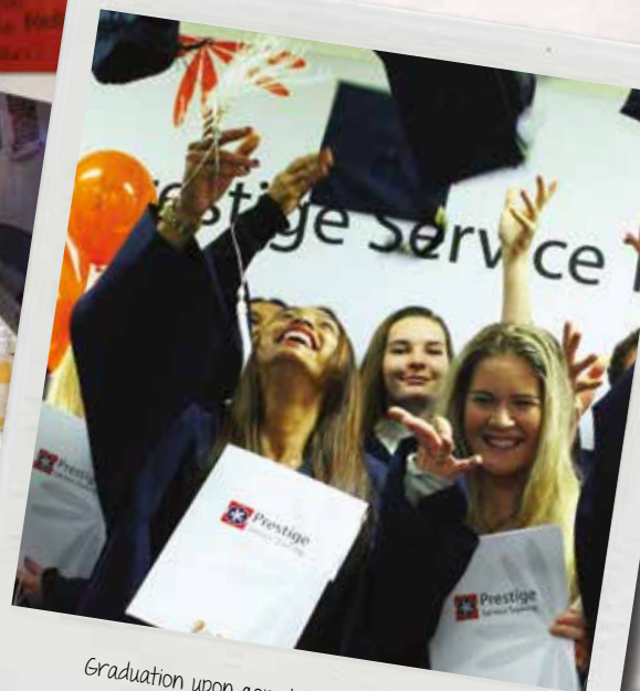
Graduation upon completion of your Diploma