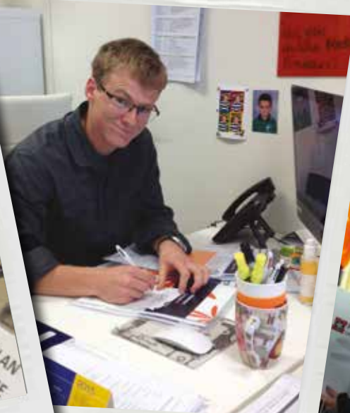
Train and learn with friends at school