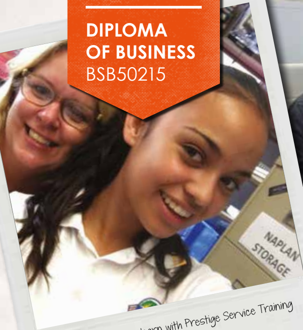
Students ready to learn with Prestige Service Training